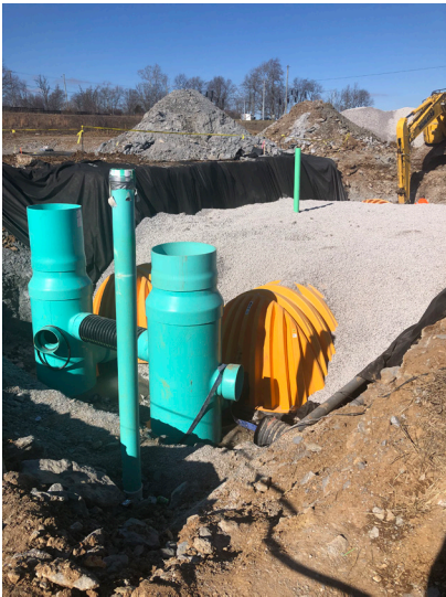
Underground detention - Dominos